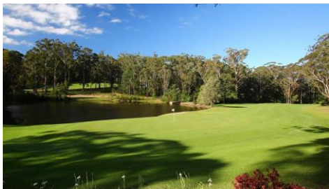
11 th Hole Mollymook Golf Club