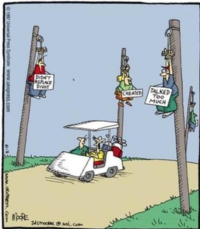
"This is a tough course."